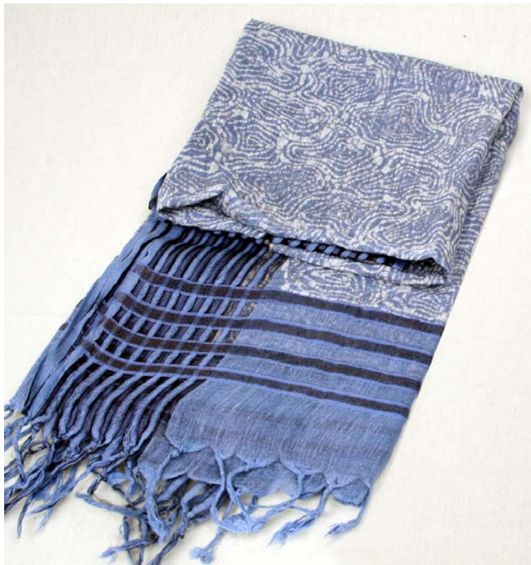
Natural-dye handpainted batik shawl Malaysia

A bronze bowl lined with pure gold that gives a sense of eggshell with a sculptural texture. The jury commended the quality of the metal work and the magnificent design. The gold leaves would reflect candle's light perfectly and create a subdued atmosphere.