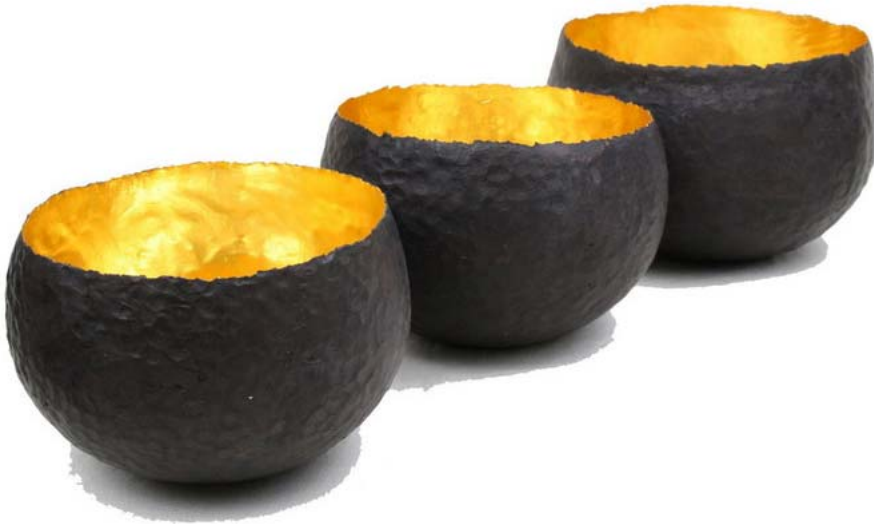
Hammered bowls Thailand

2007 Award of Excellence for Handicrafts (2 examples among the 23 awardees)