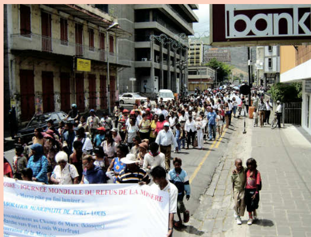
October 17 - Mauritius

It can be signed on line at www.oct17.org