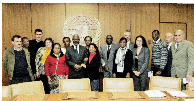
Meeting at the UN with Kofi Annan - 2005