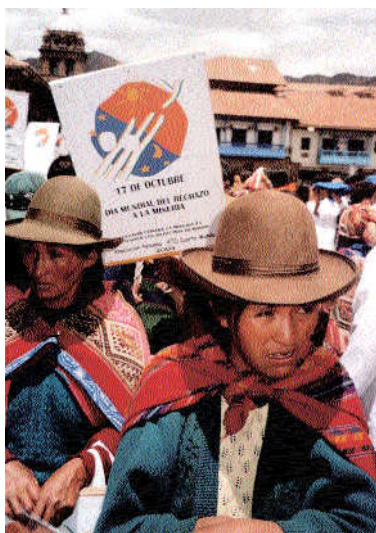
October 17 in Cusco - Peru

to publicise the actions led by this social movement, to heighten public awareness and give to as many people as possible the opportunity to find out how they too can become involved.