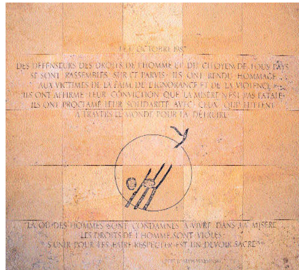
Commemorative stone in honour of victims of extreme poverty unveiled at a rally of the defenders of human rights in 1987. (Trocadero, Paris, France)

- Question public authorities at all levels - local, national and international - to ask them to recognise the energy of this social movement and to contribute to it. To do this they can find out about and take into account, in policy and administrative decision making, the positive results obtained by actors of this movement, and financially support these initiatives so that they develop more widely.